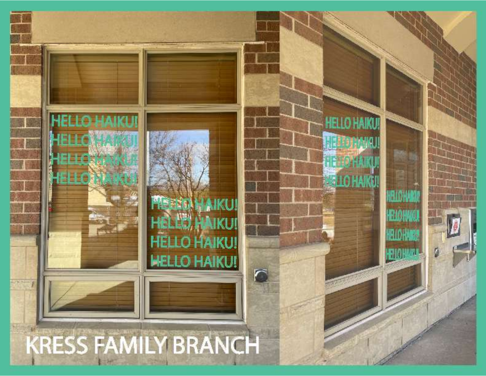
KRESS FAMILY BRANCH